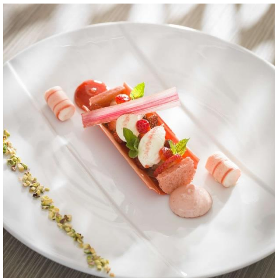
gastronomic restaurants Michelin starred