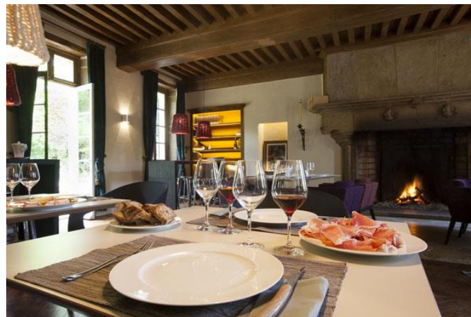
Table d'hotes at the winemaker's