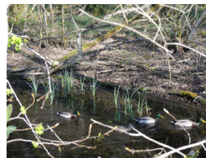
mallards on the Canal