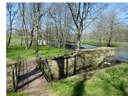
the river Aron