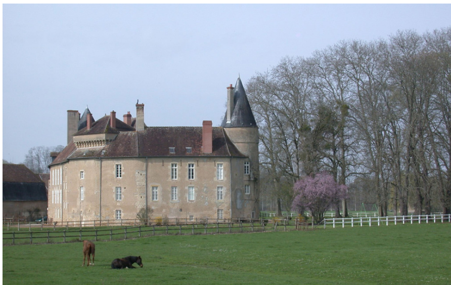
Castle of Vandenesse