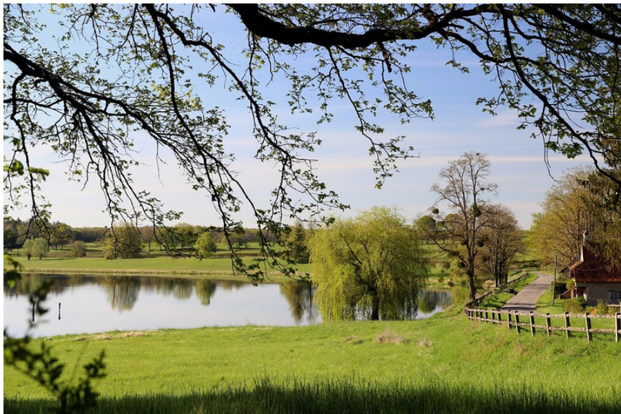
Étang de Chèvres