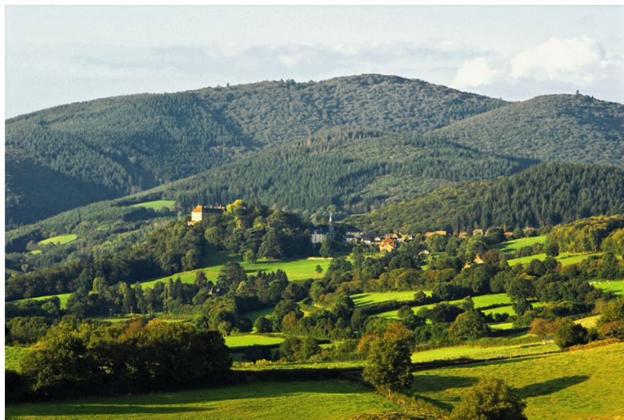
Larochemillay and Mont Beuvray