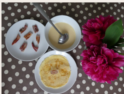
Crapiaux du Morvan

Once golden brown, fry the crapiaux on the other side. Serve hot.