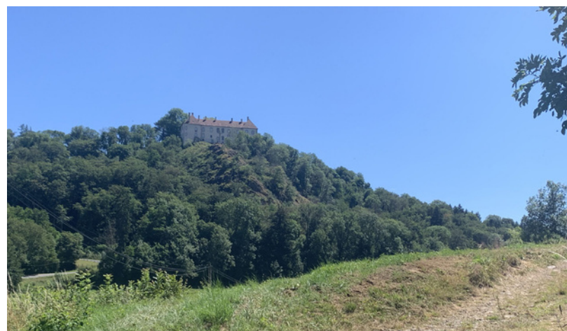
castle of Larochemillay