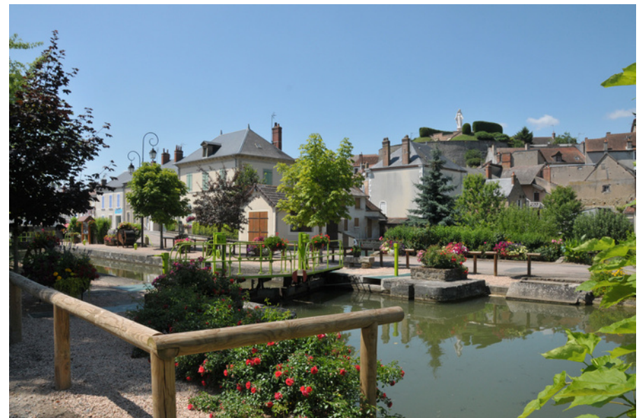
sluice of Cercy-la-Tour