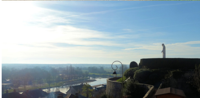
Moulin Chevillon ; Notre-Dame