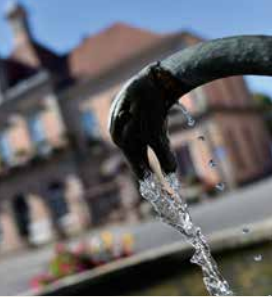
A 16th Century extraction site