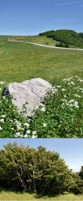
The Ballon d'Alsace summit seen from Les Fagnes