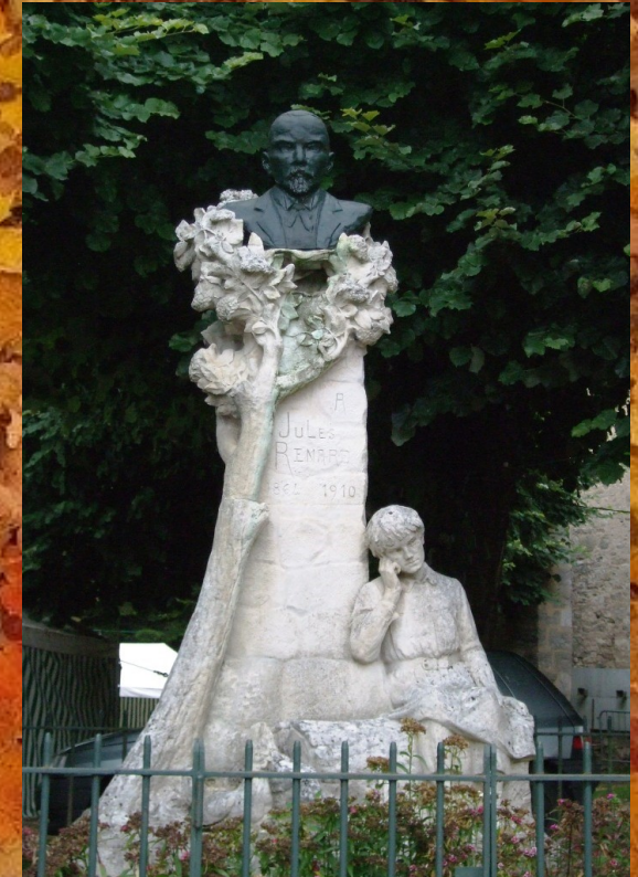
Jules Renard monument, 1913, by Charles Pourquet.

Jules Renard (1864-1910) – man of letters