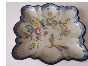
Faïence de Saint-Honoré-les-Bains