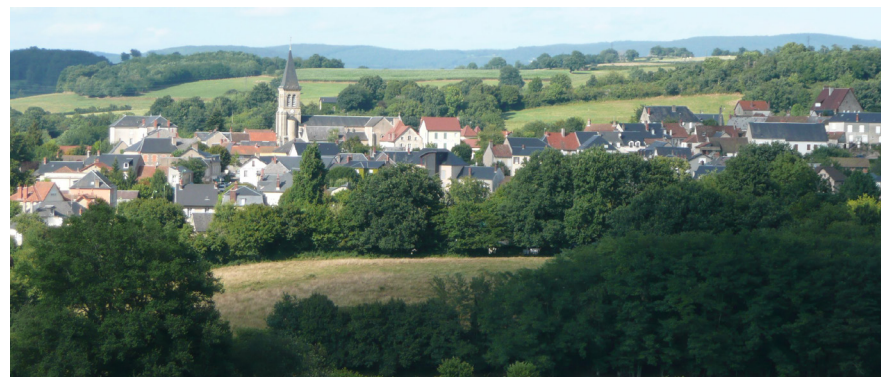
Panorama sur Saint-Honoré-les-Bains