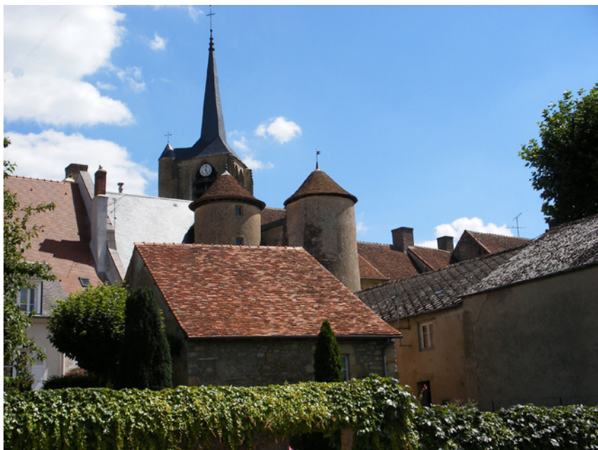
village center of Moulins- Engilbert