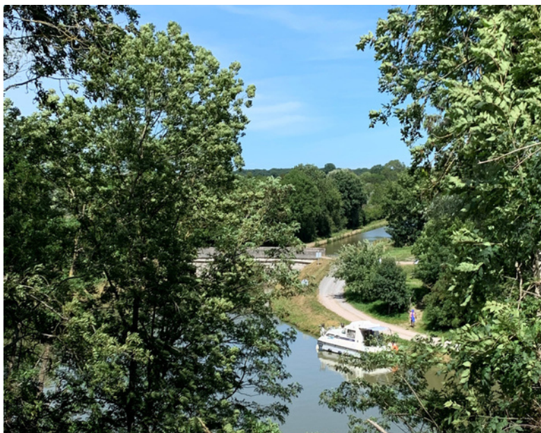
The Nivernais Canal