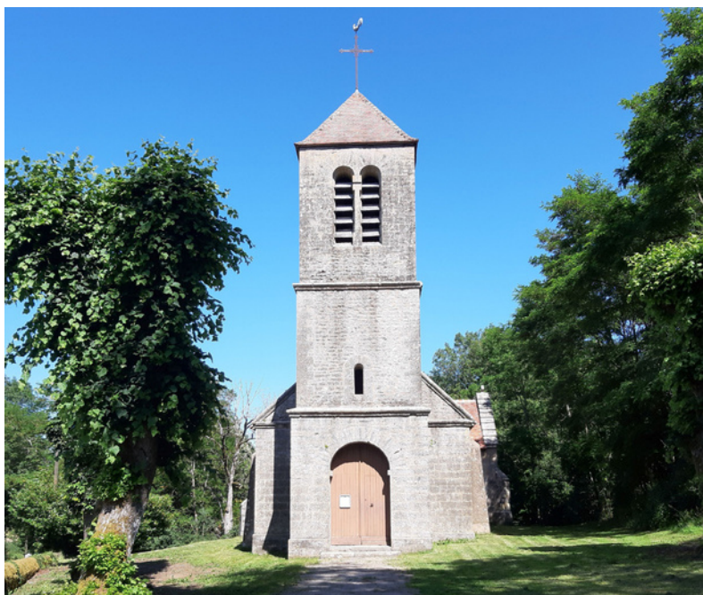
Church of Brinay