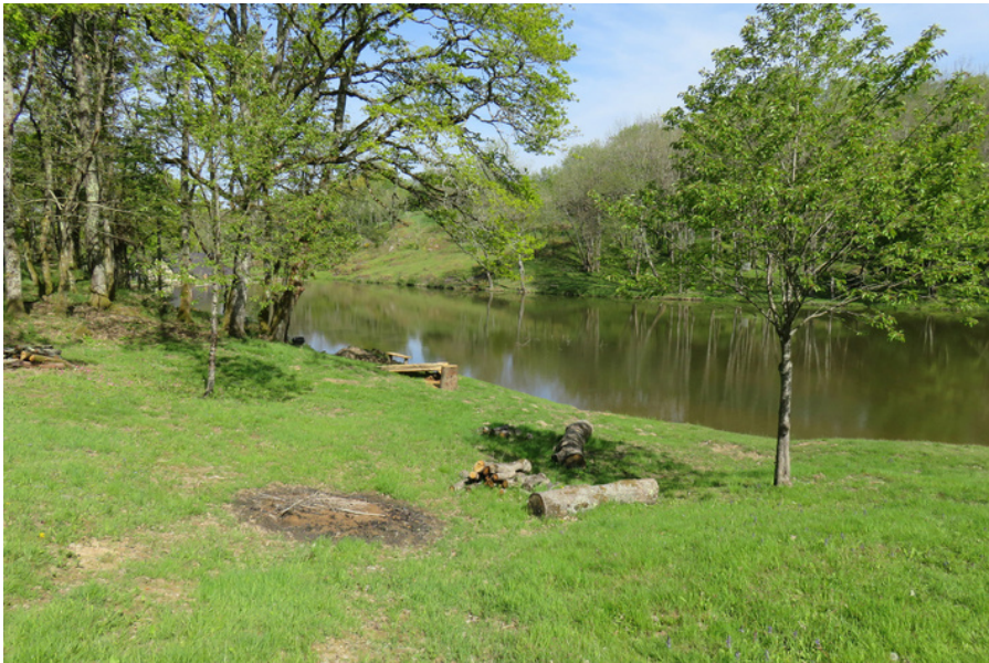
pond of moulin de Queudre