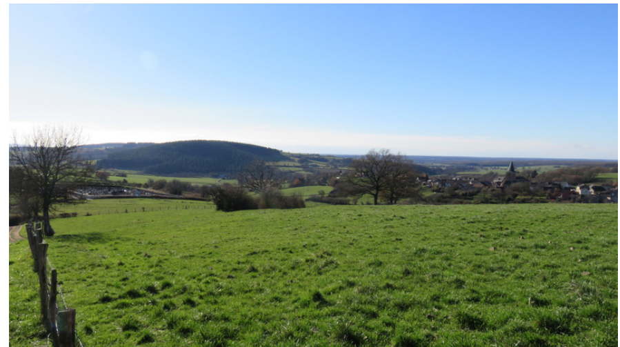
first abutment of Morvan