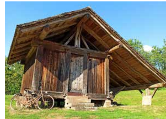
A chalot (Écomusée)