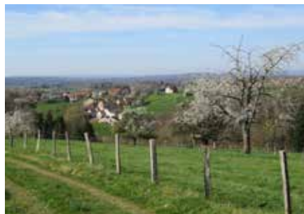
A view of La Ramouse hamlet