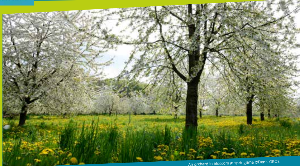
An orchard in blossom in springtime

Winding through nature, memories and mystery, the Pierres de Roûge trail is an invitation to explore the heart of Fougerolles' heritage. Along the way, discover the secrets of orchard meadows, forests, streams and the sandstone rocks shaped by time, nature, and people. An immersive and sensory journey through a living landscape.