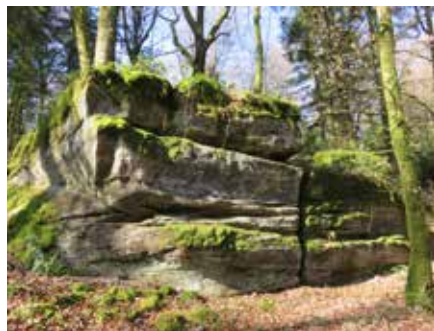
A block of sandstone