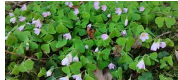
Wood sorrel

Cross a little bridge, to reach the foot of the Pierres de Rouge cliffs and continue with the Pochattes stream on your left. The stream is home to a protected species: the white-clawed crayfish.