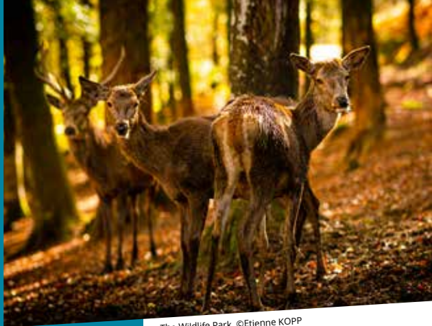
The Wildlife Park