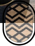
LE CHÂTEAU BOURGOGNE

To sublimate your meal, discover our wine list of 300 wines from Burgundy and elsewhere. A real journey through the regional grape varieties and appellations!