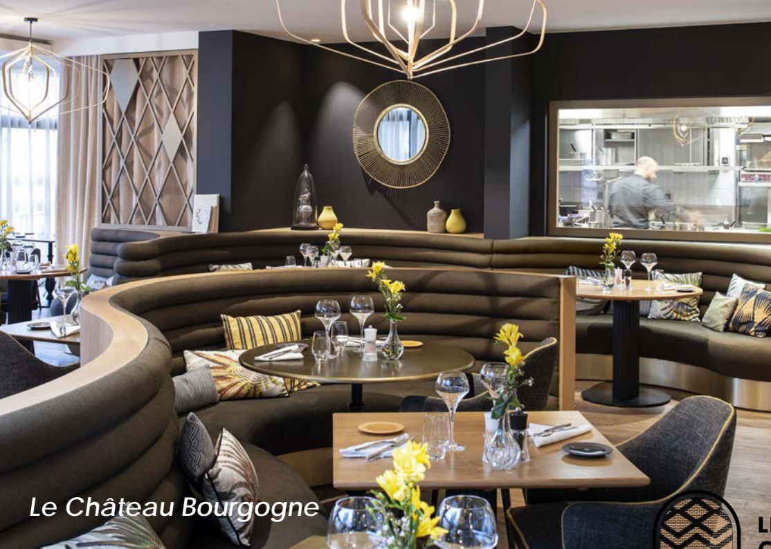
Le Château Bourgogne