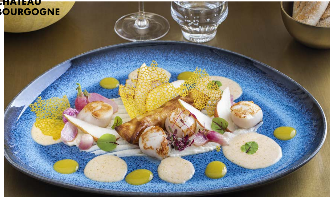
Chef's favorite meal: Scallops