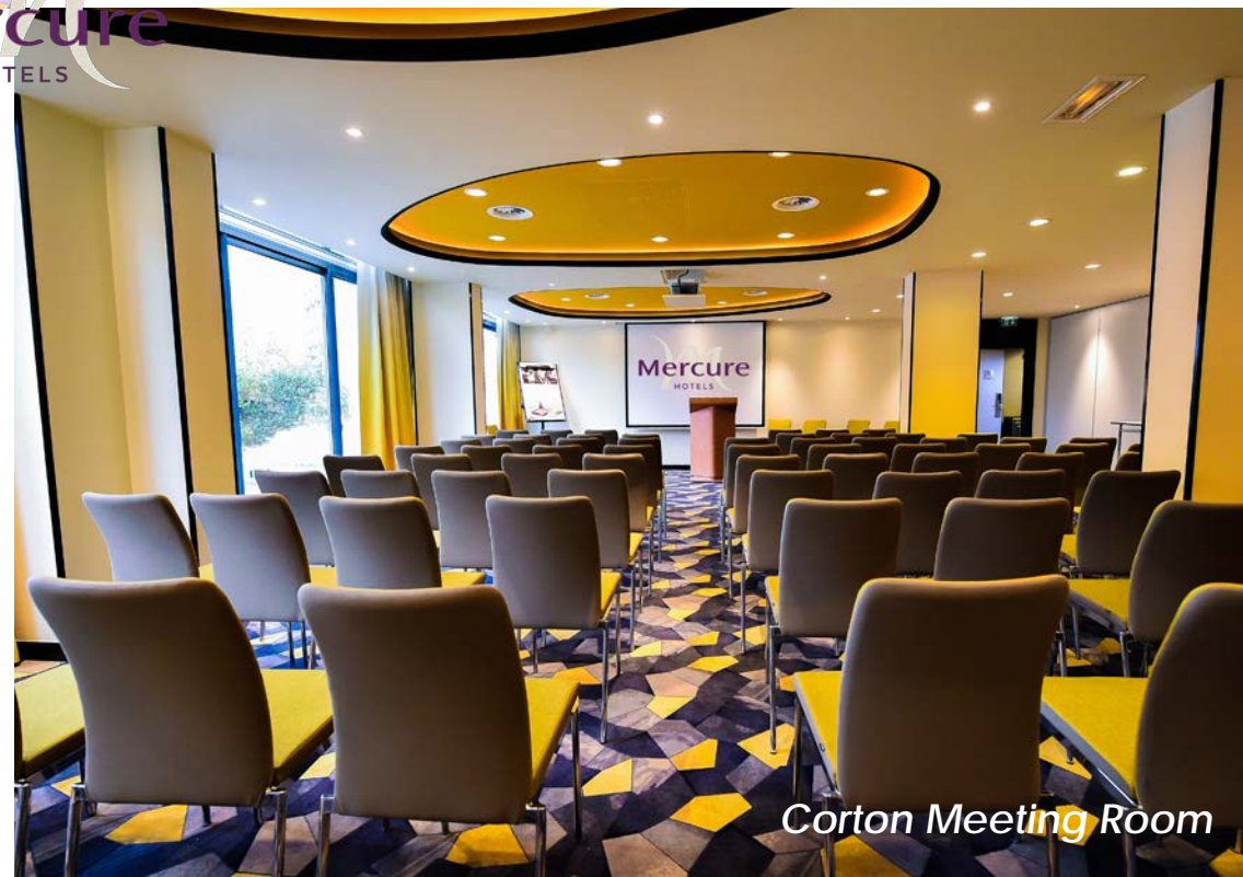
Corton Meeting Room