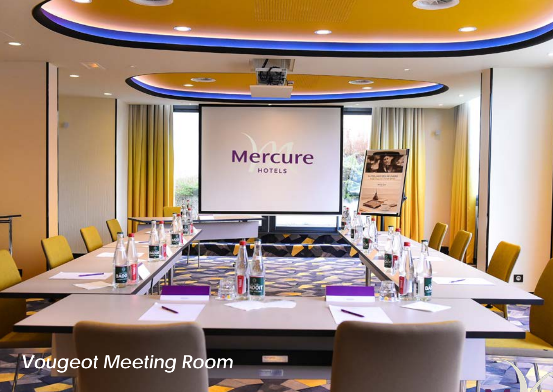
Vougeot Meeting Room

A business event is a privileged moment, for which you need the best ! For your work sessions, the hotel offers you 300 square-meter modular rooms, fully equipped with WIFI connection, air-conditioned, a screen with a video projector, a paper-board and everything you need, on request. Rooms can welcome until 200 guests.