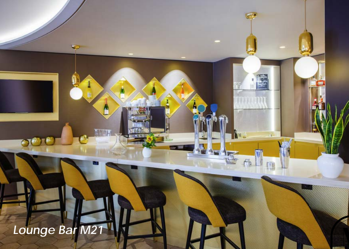
Lounge Bar M21