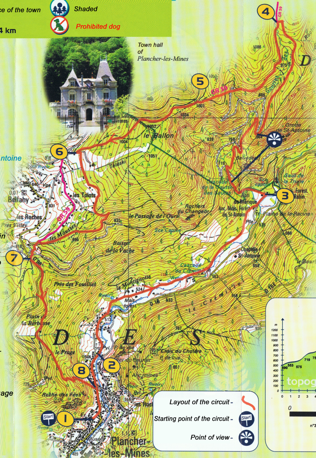
Town hall of Plancher-les-Mines

(vegetation rich in beeches, conifers, bilberries, bilberries). Lead to the carpark of the ski station of Belfahy.